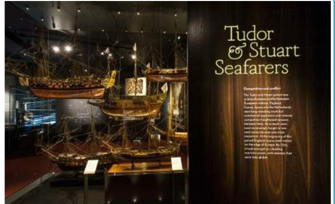
Tudor and Stuart Seafarers