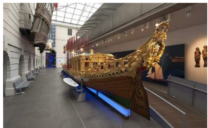
Prince Frederick's Barge