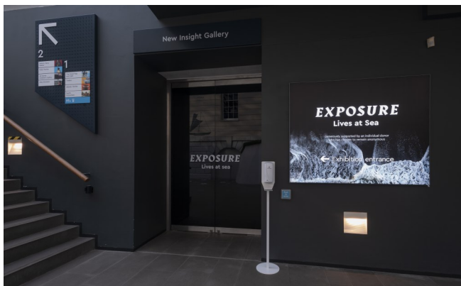
Exposure: Lives at Sea