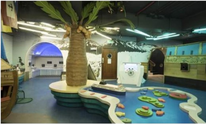
You can play in the AHOY gallery on the Ground Floor