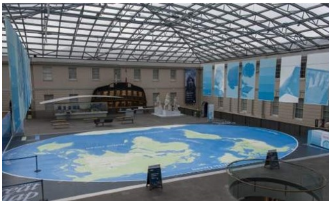
You can play on the Great Map on level 1