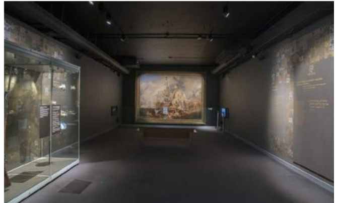
The Turner gallery