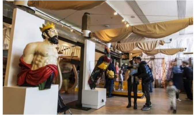
You can play in the All Hands gallery on level 2