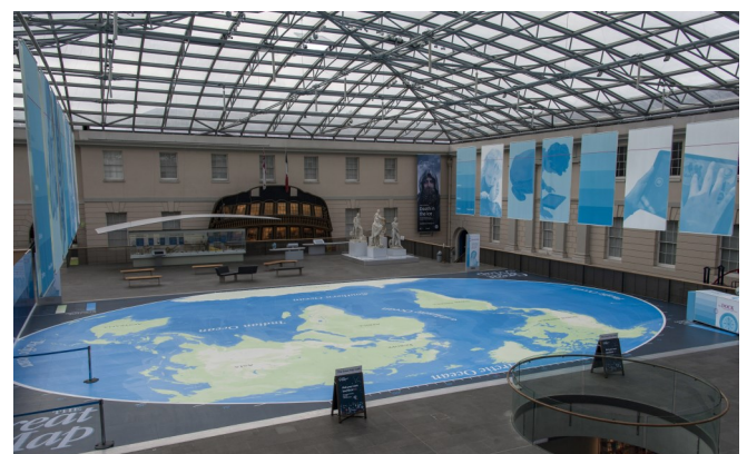
The Great Map

To go down a level, to the Ground floor, you can use the lifts and stairs.