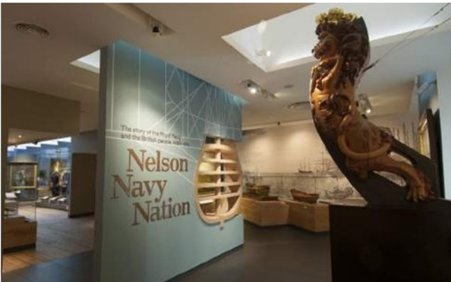
Nelson, Navy, Nation