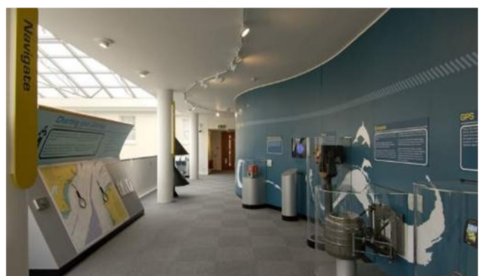
You can play on the Bridge on level 2