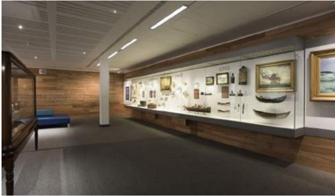
The Voyagers gallery